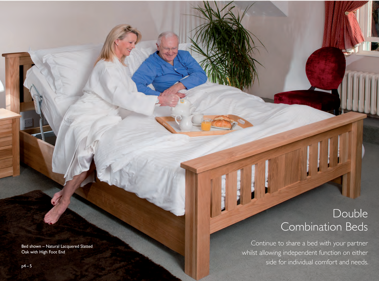
Bed shown – Natural Lacquered Slatted Oak with High Foot End