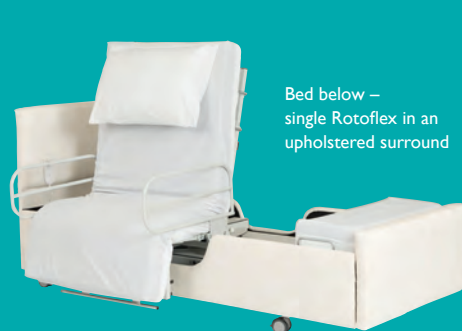
Bed below – single Rotoflex in an upholstered surround