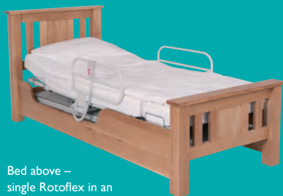
Bed above – single Rotoflex in an oak surround